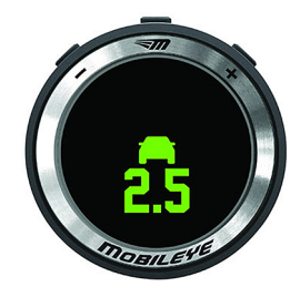
Forward Monitoring & Warning