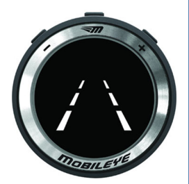
Lane Departure Warning