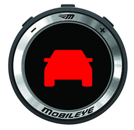
Forward Collision Warning