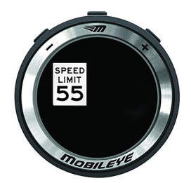
Speed Limit Indicator